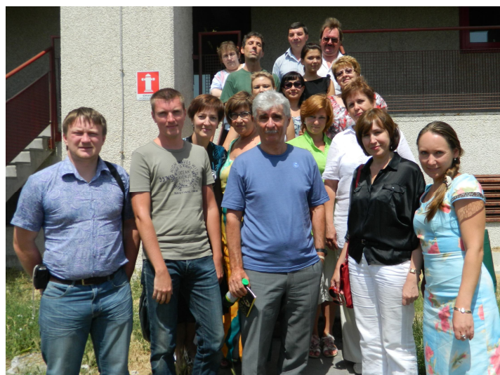
Photo 2. Russian and Italian colleagues at Parma University

Overall, the internship program was quite informative and at the same time creative. These internships make a significant contribution to the exchange of experience between different universities as well as in strengthening cooperation between them.